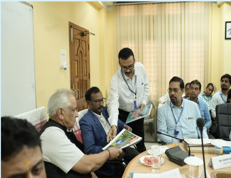
NAAC PEER TEAM VISIT- 19 & 20 MAY 2023