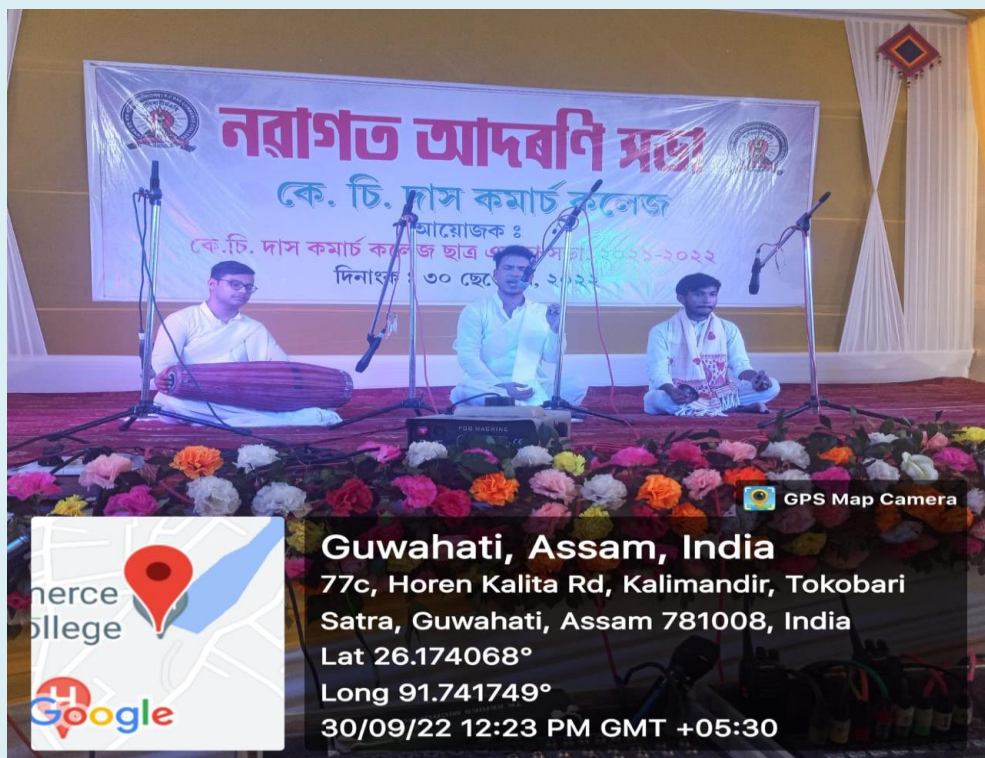
CELEBRATION OF FRESHMEN SOCIAL 2022