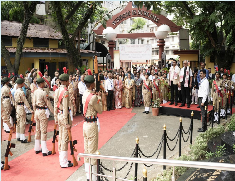
NAAC PEER TEAM VISIT - 19 & 20 MAY 2023