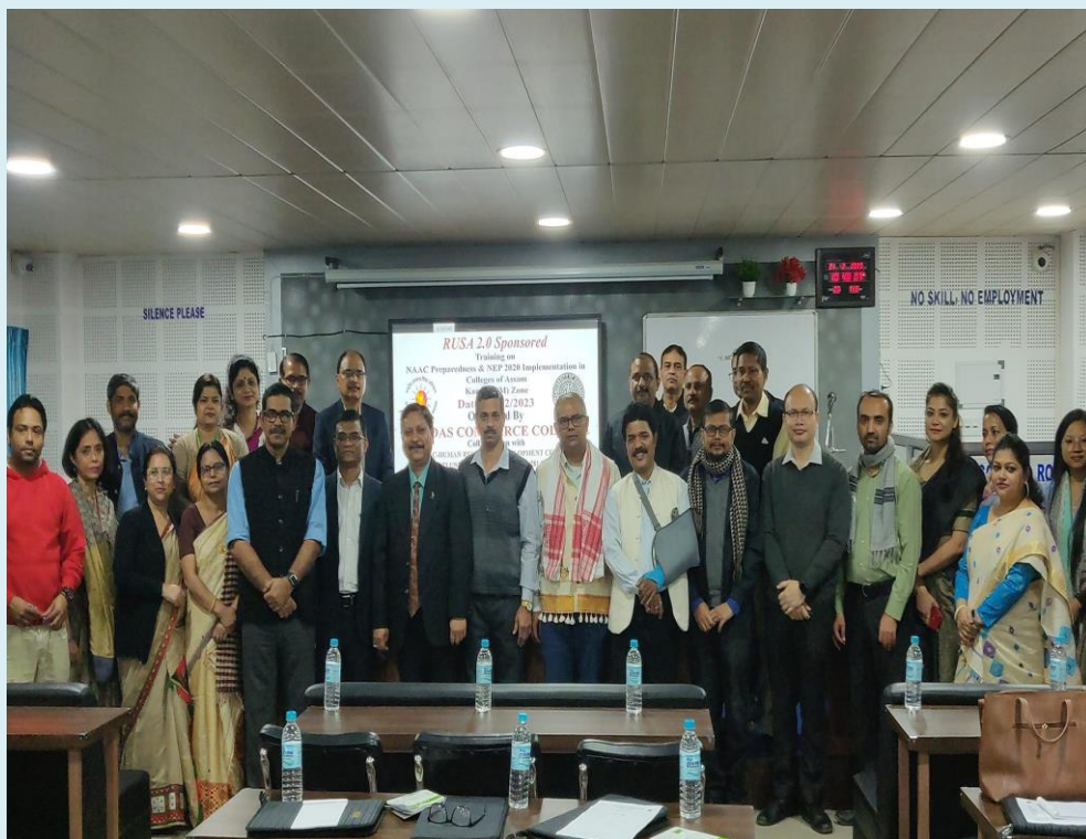
RUSA 2.0 TRAINING ON NAAC PREPAREDNESS AND NEP IMPLEMENTATION IN COLLEGES OF ASSAM, KAMRUP METRO ZONE ON 21ST FEBRUARY, 2023 ORGANISED BY THE COLLEGE IN COLLABORATION WITH UGC- HUMAN RESOURCE DEVELOPMENT CENTRE, GAUHATI UNIVERSITY