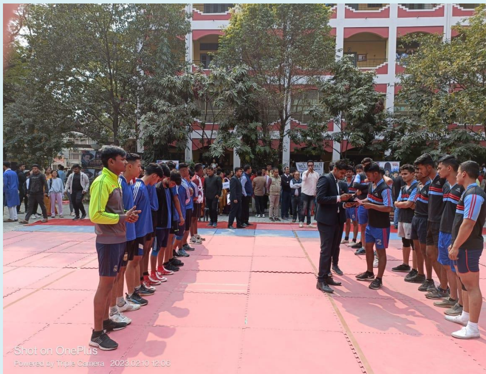
COLLEGE WEEK FESTIVAL 2023