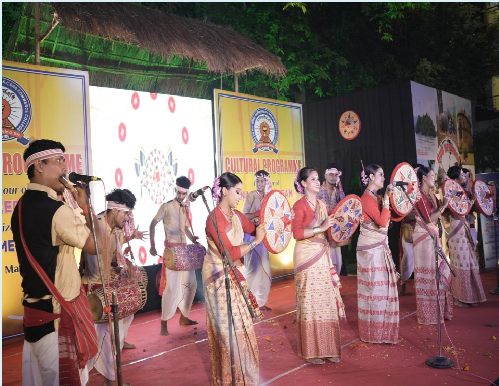
CULTURAL PROGRAMME IN HONOUR OF NAAC PEER TEAM VISIT 19 MAY 2023