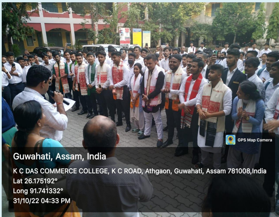
RESULT DAY- STUDENTS' UNION ELECTION 2022