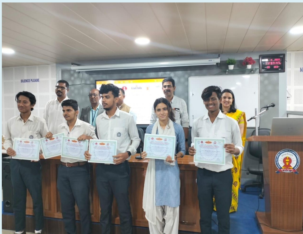
ONE DAY PEOPLE'S EDUCATION PROGRAMME (PEP) ORGANIZED BY KHADI AND VILLAGE INDUSTRIES COMMISSION UNDER MINISTRY OF MICRO, SMALL AND MEDIUM ENTERPRISES (MSMES) IN COLLABORATION WITH INNOVATION CELL OF THE COLLEGE ON 29TH MARCH 2023