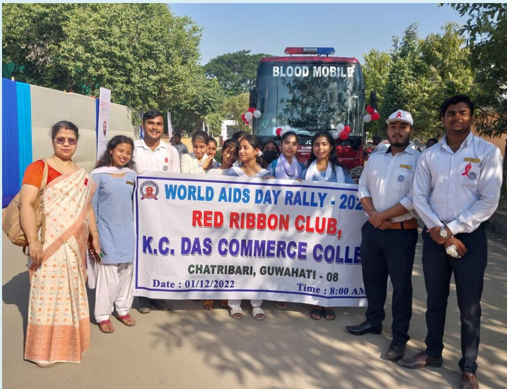
WORLD AIDS DAY RALLY 2022