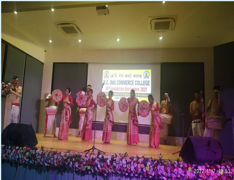
CELEBRATION OF 39 TH FOUNDATION DAY 2022