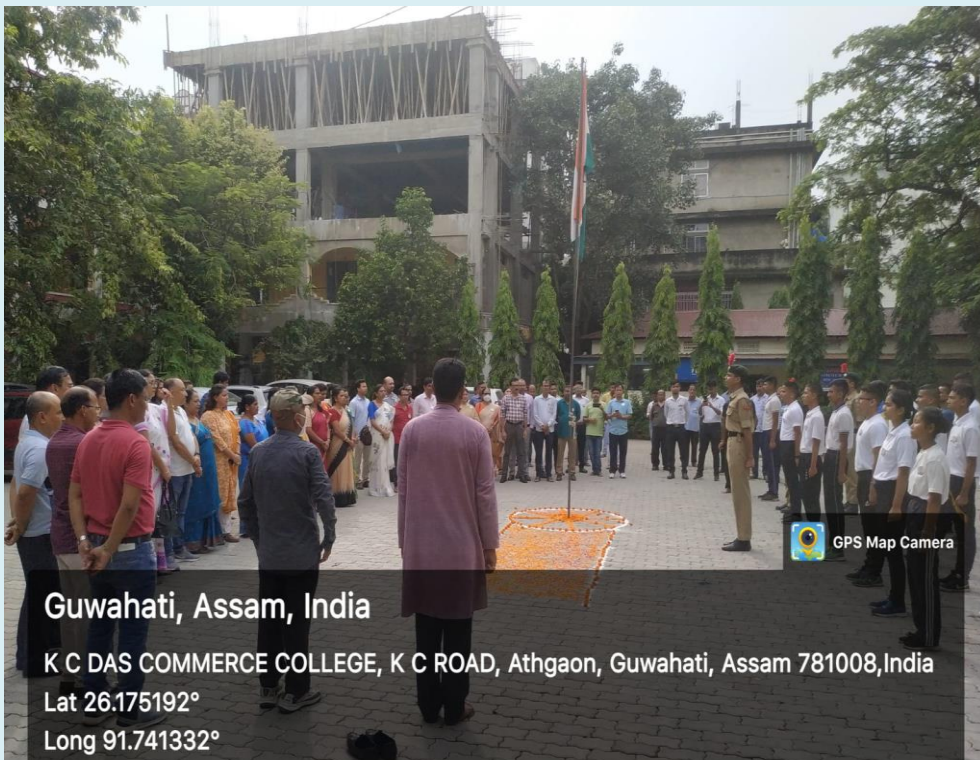
CELEBRATION OF INDEPENDENCE DAY 2022