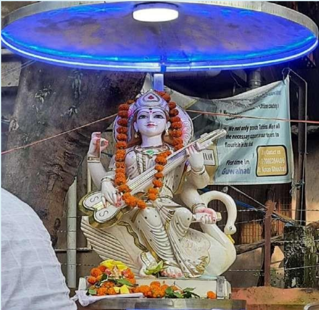
SARASWATI IDOL IN THE COLLEGE CAMPUS