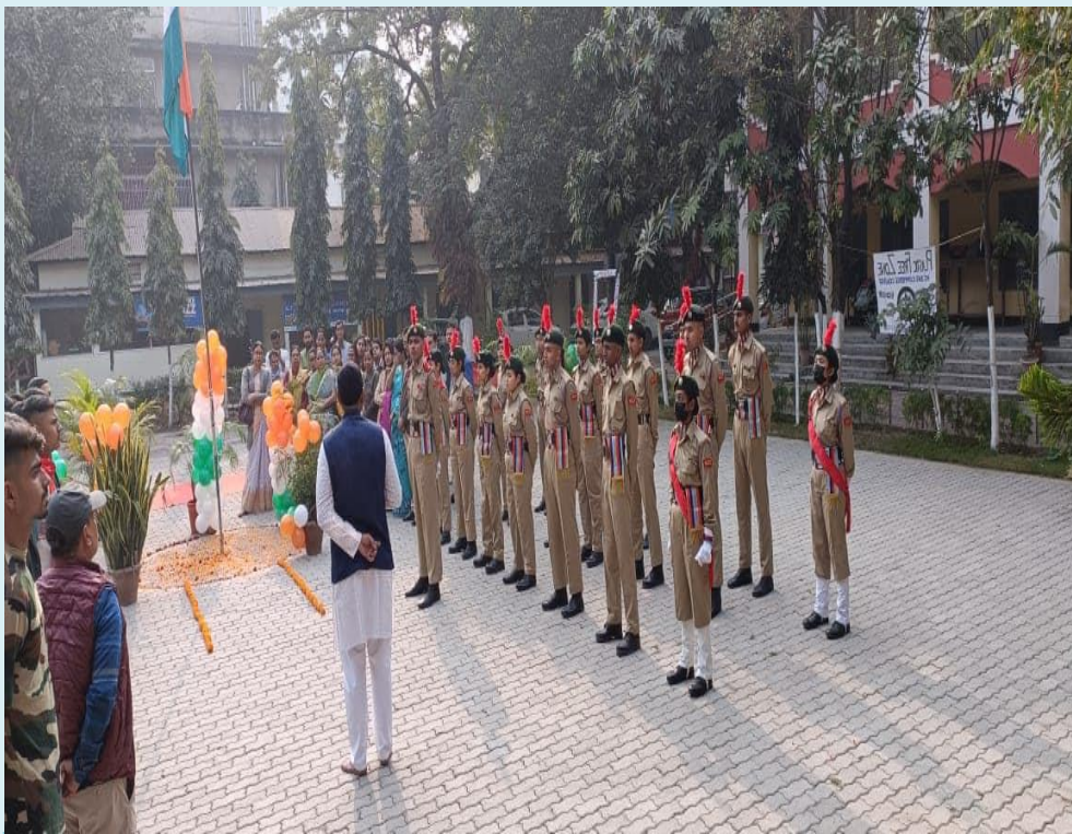
CELEBRATION OF REPUBLIC DAY 2023