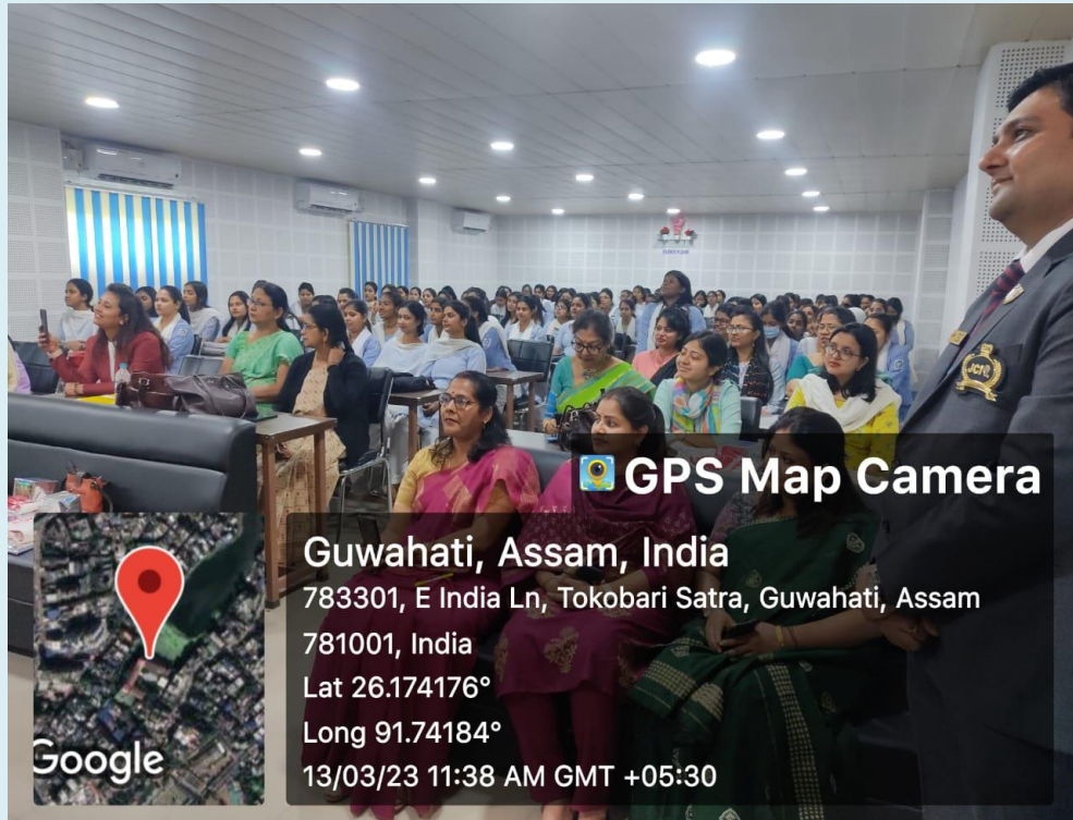
INTERNATIONAL WOMEN'S DAY CELEBRATED BY THE WOMEN'S CELL OF THE COLLEGE