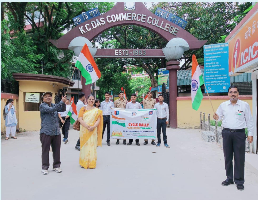
CELEBRATION OF INDEPENDENCE DAY 2022